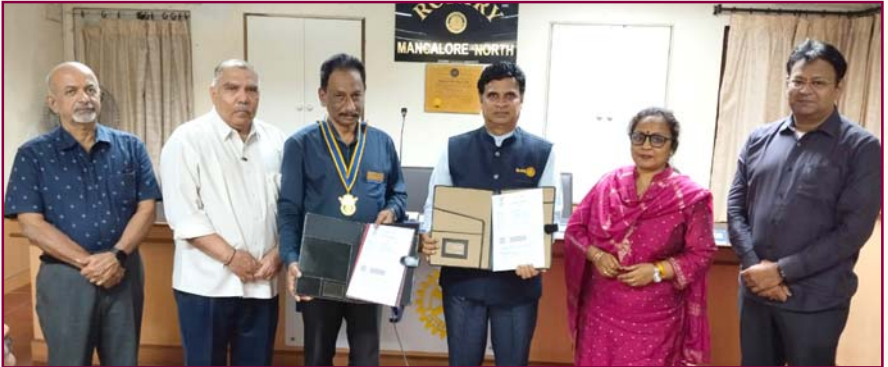
MoU between Shree Devi Institute of Technology and Rotary Club of Mangalore North

Since the program's inception in 2002, Rotary Peace Centers have trained over 1,800 fellows who now serve in more than 140 countries. These individuals work as leaders in government, NGOs, educational and research institutions, peacekeeping and law enforcement agencies, and international organizations such as the United Nations and the World Bank.